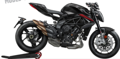
METALLIC CARBON BLACK (GLOSS)