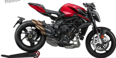
METALLIC MADNESS RED (GLOSS) METALLIC CARBON BLACK (GLOSS)