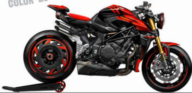
MAMBA RED 2.0 (GLOSS)/ INTENSIVE BLACK (GLOSS)